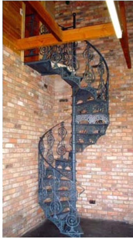
An overall view of a staircase consisting of 16 steps and custom made top landing.