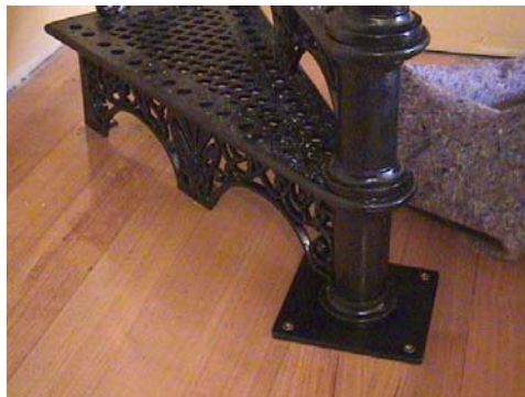
Base fixing is achieved by creating a bottom plate which is fastened to the floor.

Below are the various castings that create each step of the Victorian spiral staircase.