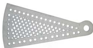
Spiral Staircase Tread