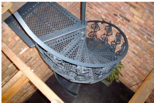
An overview illustrating the wrought iron handrail and custom made landing which is laser cut and matching the detailed pattern of the step to the landing.