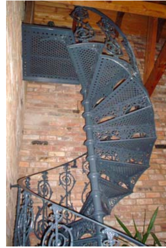
An underside view detailing the underside of the custom made landing and securing of handrail to the wall.