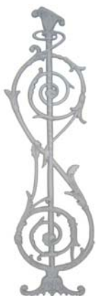
Spiral Staircase Newel

Below are the various castings that create each step of the Victorian spiral staircase.