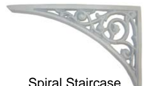
Spiral Staircase Outer Gusset Rid