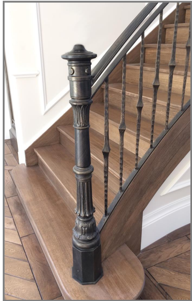
Jordan Bollard pictured with PC9 Post Cap.